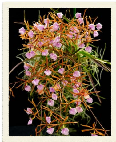
Encylia bractescens Grown by Calvin Lo