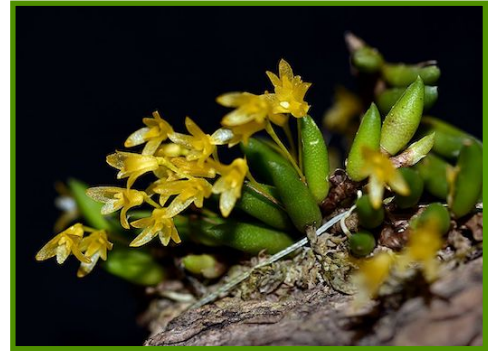
Pleurothallis leptotifolia 'GC'