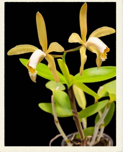
Cattleya forbesii Grown by Calvin Lo