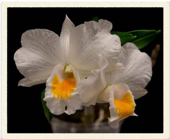
Dendrobium Formidable Grown by Calvin Lo