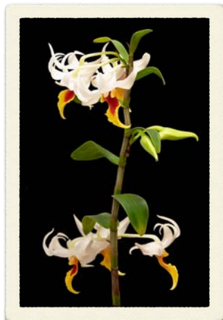
Dendrobium Tesseract Grown by Calvin Lo