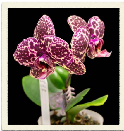
Phalaenopsis Lioulin Wild Cat Grown by Lynn Campbell