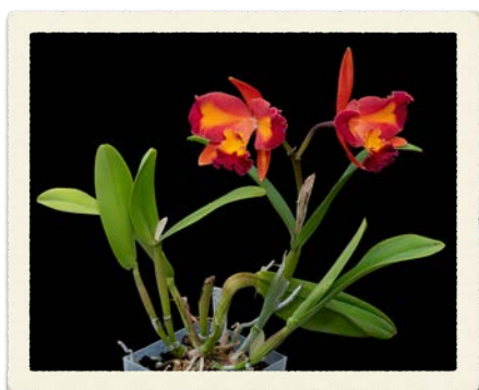
Cattlianthe Aussie Sunset 'Cosmic Fire' AD/AOC Grown by Pat Randall