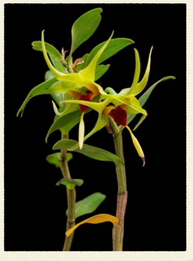
Dendrobium tobaense Grown by Calvin Lo