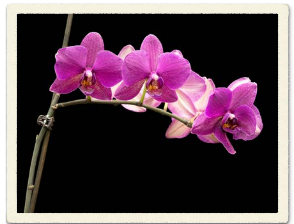
Phalaenopsis NOID Grown by Moyca Stoffe