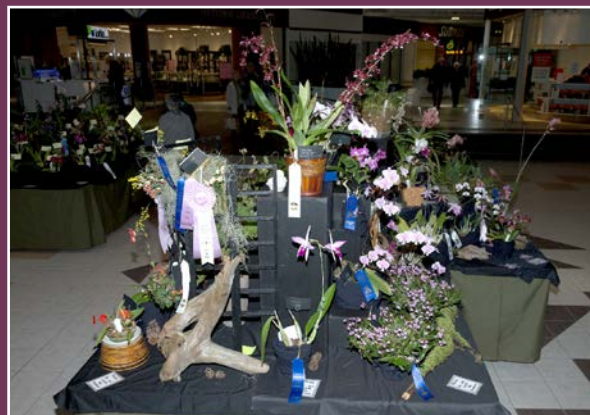
Show Trophy 'Orchids From Afar' ST/AOS 83 pts Exhibitor: Central Vancouver Island Orchid Society