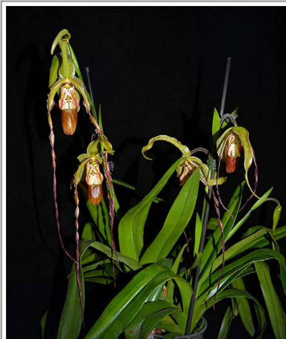
Phragmipedium Grande ( Phrag longifolium x Phrag humboldtii ) Grower: Sherida Gregoire