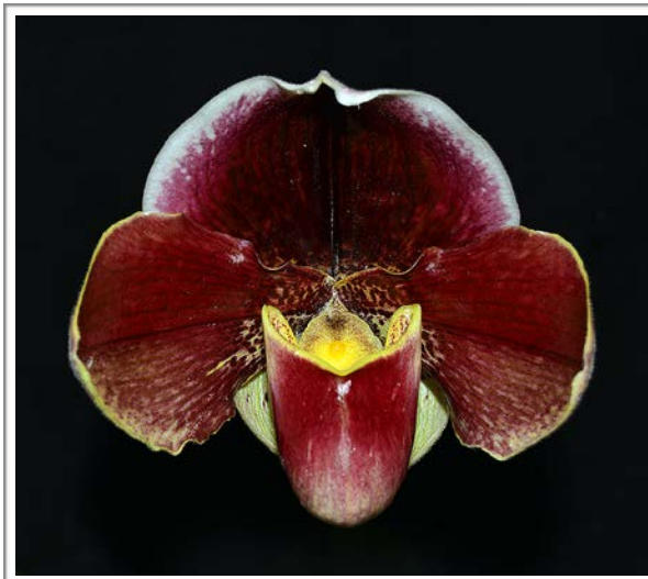
Paphiopedilum Valiant Red ( Paph. Orchilla x Paph. Valwin) Grower: Sherida Gregoire