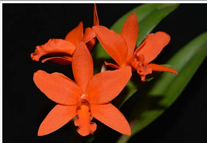
Rhyncattleanthe Young-Min Orange ( Rhyncattlianthe Viola Nuggett x Cattlianthe Trick or Treat) Grower: Pat Randall