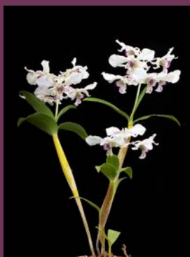
Dendrobium Nora Tokunaga 'Paramount's Valerie & Gabychat' HCC/AOS 76pts ( Dendrobium atrovioleaceum x Dendrobium rhodostictum ) Exhibitor: Paramount Orchids