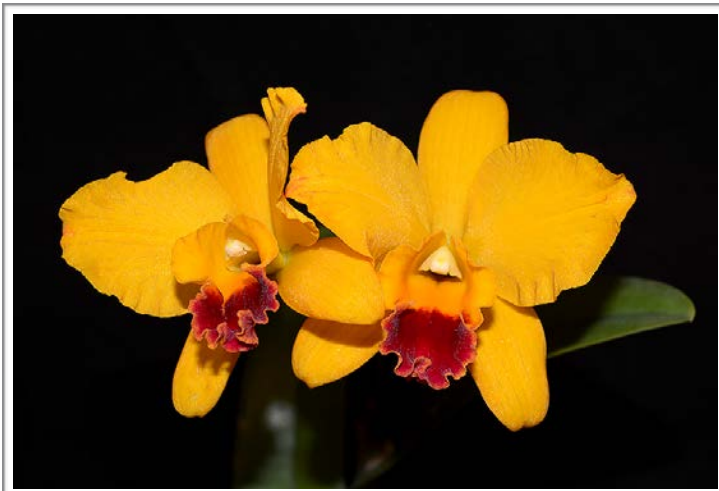
Potinara Tropical Sunset 'Oceans Heaven' x Laeliocattleya Tokyo Magic '6-1' AM/AOS Grower: Pat Randall