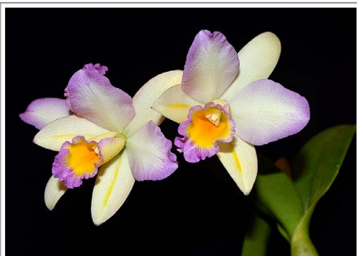
Rhyncattleanthe Kaboom 'SVO' x Rhyncattleanthe Love Sound 'Dogashima' AM/AOS Grower: Pat Randall