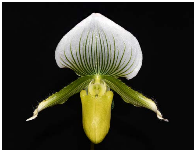
Paphiopedilum Hilo Key Lime 'Winter Green' x Paph. Hsinying Majakun #7' Grower: Pat Randall