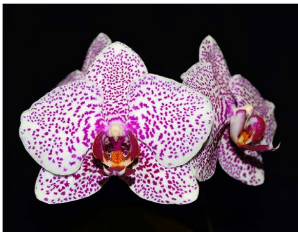
Phalaenopsis France Jaguar Grower: Merle Ward