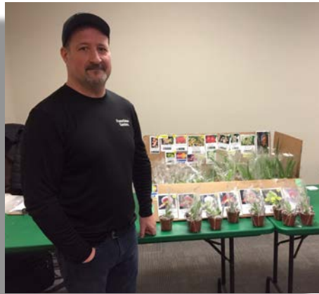
SOS meeting Jan 2020