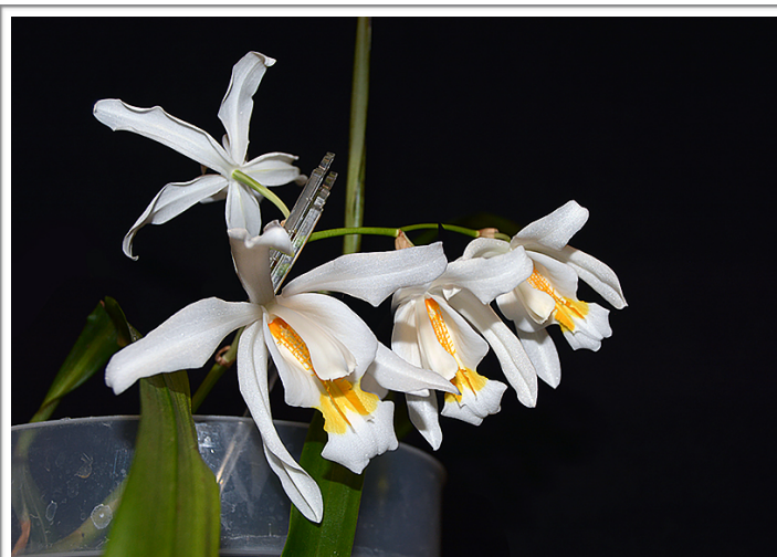
Coelogyne cristata Grower: Merle Ward