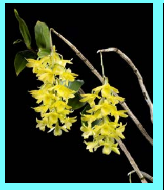
Dendrobium cerinum 'Mellow Yellow' CCM/AOS 87pts Exhibitor: Darrel Albert

Please note that AOS award photographs are only permitted to be used for AOS and affiliated societies purposes and programs. All awards are considered provisional until paperwork and payment is processed by AOS and published in <u>Orchid Plus</u>.