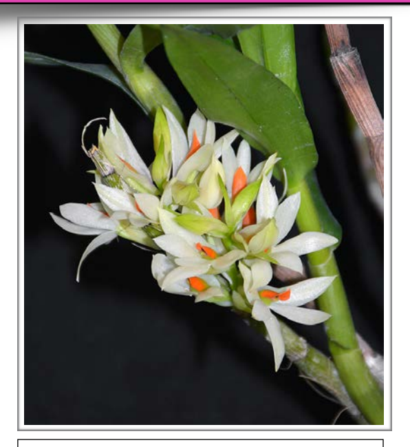
Dendrobium bracteosum var. album x sib Grower: Lynn Campbell