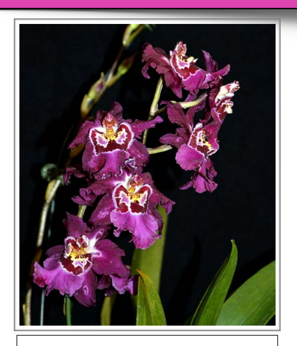
Vuylstekeara Camouflage 'Everglades Passion' Grower: Pat Randall