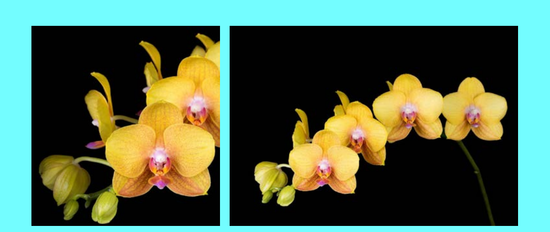
Phalaenopsis Brother Sara Gold 'Mellow Yellow' AM/AOS 82pts Exhibitor: Paul Paludet