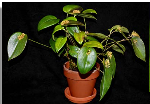
Pleurothallis canaligera Grower: Sara Thue