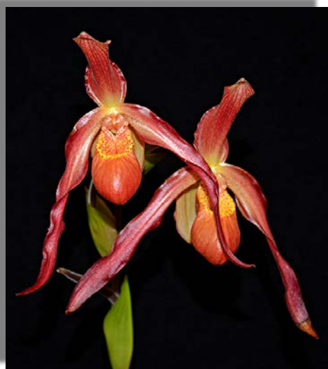
Phragmipedium Ruby Slippers ( Phrag. caudatum x besseae ) Grower: Bob Lucas