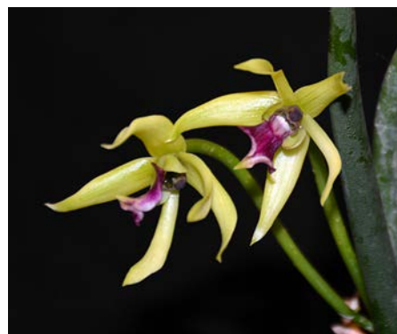
Leptotes bicolor 4N Grower: Yvette Lyster