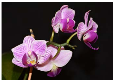
Phalaenopsis Grown by Gerald Pitka