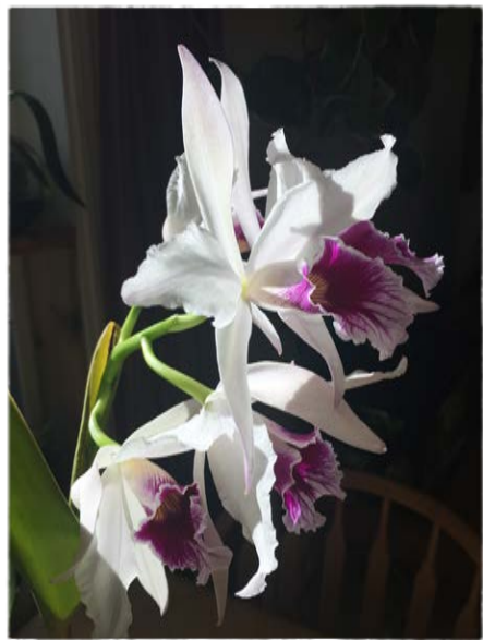
Laelia purpurata var. striata

DAY PASSES FOR VOLUNTEERS: will be distributed at the March 18 general meeting and during the setup on Thursday, March 22. If you cannot attend either of these events, please arrange for someone else to pick up your pass.