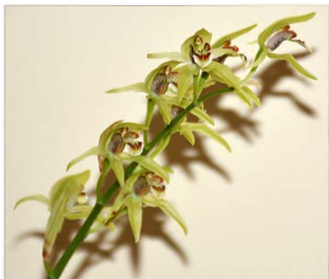
Coelogyne marmorata

Heather and Cheryl will organize pick up of the pre-ordered plants at the show and transport back to Saskatoon. Pickup details to follow.