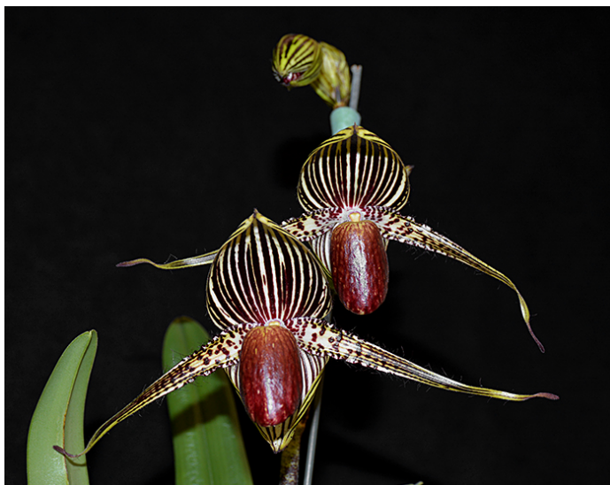
Paphiopedilum rothschildianum ( 'Song Thrush' x 'Blackbird' ) Grower: Heather Anderson