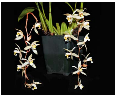
Coelogyne flaccida Grower: Calvin Lo