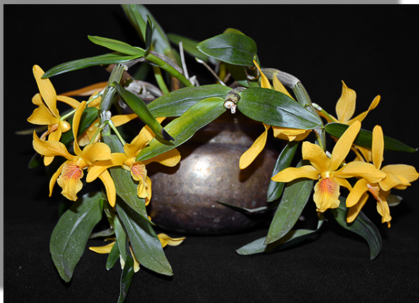
Dendrobium Stardust 'Chiyomi' ( Den. unicum x Den. Ukon ) Grower: Lynn Campbell