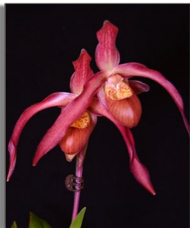
Phragmipedium Ruby Slippers ( Phrag besseae x caudatum ) Grower: Bob Lucas