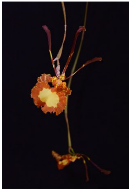
Psychopsis papillio x versteegianum 'Pavain' Grower: Pat Randall