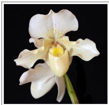
Paphiopedilum F.C. Puddle FCC/RHS Grower: Lynn Campbell