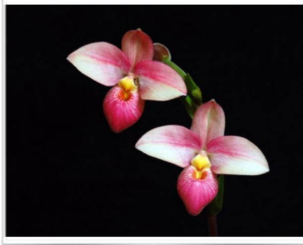
Phrag Hanne Popow

numbers will be drawn randomly; when your number is drawn you may choose one plant to purchase. After all numbers have been drawn any remaining plants can be purchased by any member, even if they didn't enter their number.