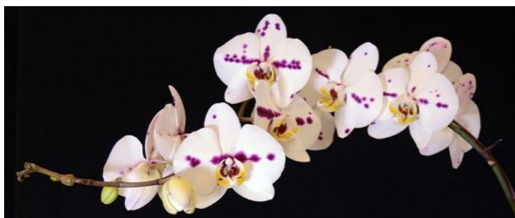
Phalaenopsis Grower: Becky Janzen