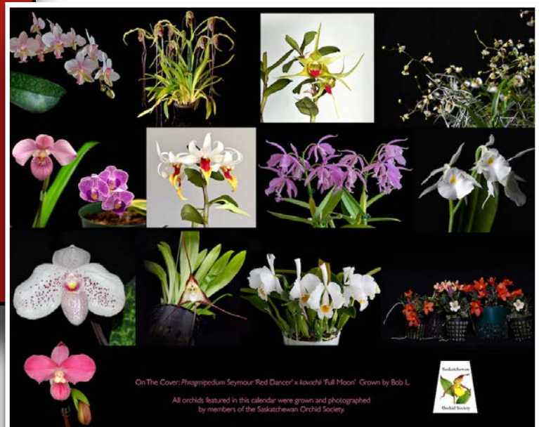
On The Cover: Phagnipedium Seymour 'Red Dancer' x laevich 'Full Moon'. Grown by Bob L.

All orchids featured in this calendar were grown and photographed by members of the Saskatchewan Orchid Society.