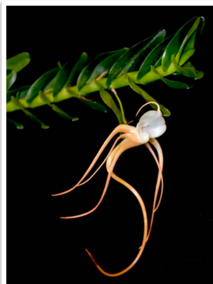
Angraecum conchoglossum Grown by Calvin Lo