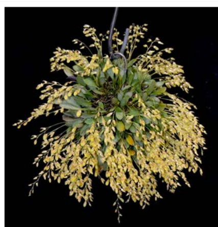
Specklinia grobyi Grown by Tracey Thue