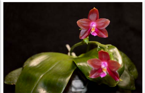
Phalaenopsis Blackberry Grown by Cody Hamilton