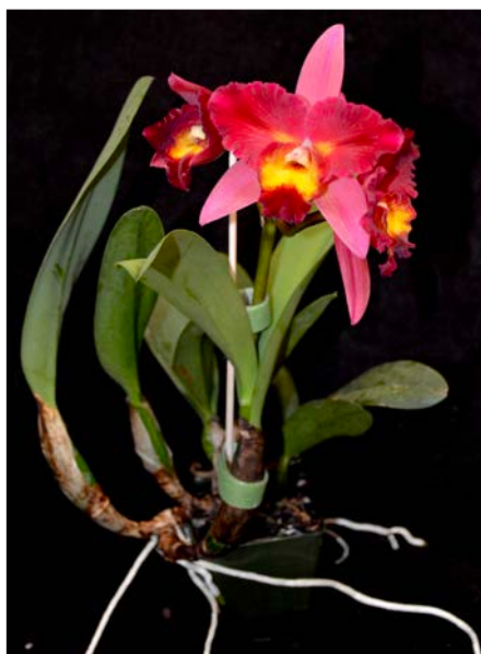
Cattleya Angel Eyes 'SVO' AM/AOS Grown by Cody Hamilton