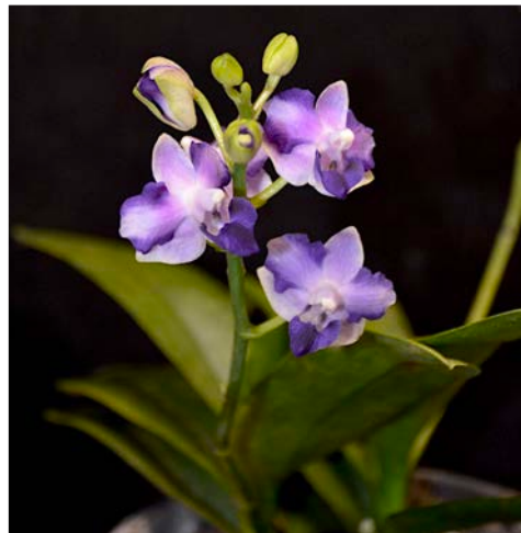
Phalaenopsis Tying Shin Blue Jay