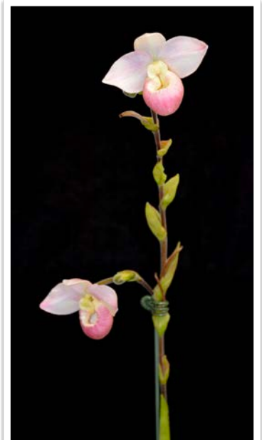
Phragmipedium April Fool