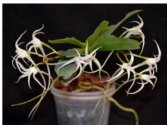
Aerangis coriasciae Grown by Calvin Lo