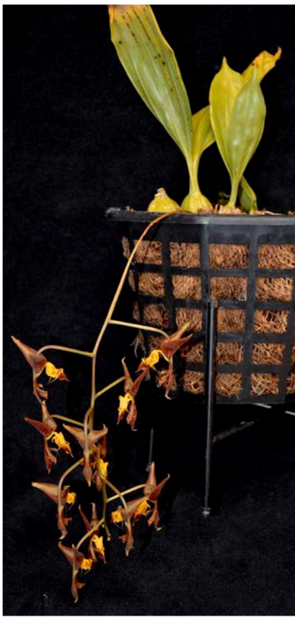
Gongora rufescens Grown by Shayne Feltis