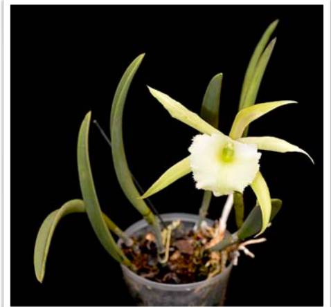
Rhynchovola Jimminey Cricket 'Superbug' HCC/AOS Grown by Jenn Burgess