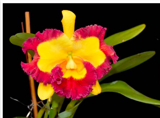
Rhyncholaelia Village Chief Rose 'Gangshan King' Grown by Merle Ward