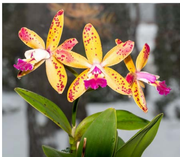
Cattleya Tropical Pointer 'Cheetah' Grown and photographed by Pat Randall