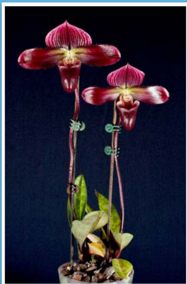
Paphiopedilum (Hung Sheng Lake x Shin-Yi Heart)