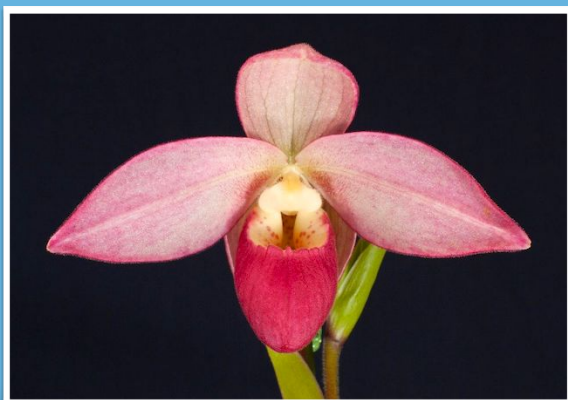
Phragmipedium Elizabeth March