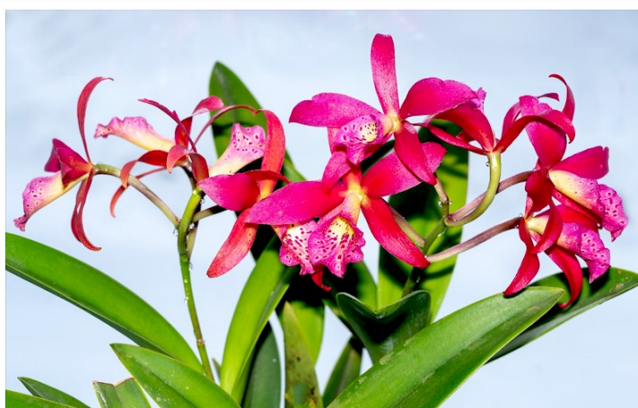
Cattleya Florence Lin x Brassanthe Maikai