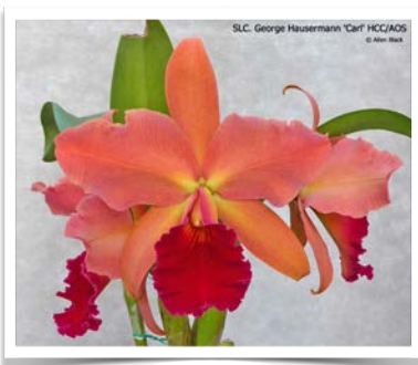
Cattleya George Hauserman 'Carl' (syn. Sophrolaeliocattleya George Hauserman 'Carl')