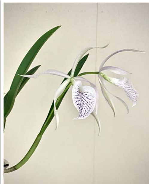
Brassocattleya Fuchs Star ( Cattleya maxima x Brassavola nodosa ) Grown by Jenn Burgess