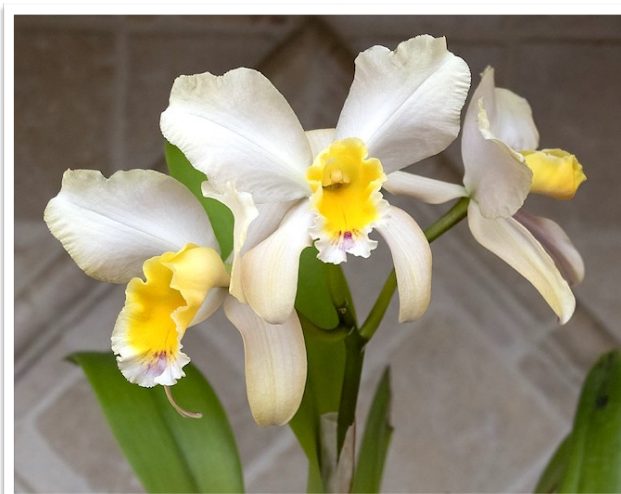
Rhyncattleanthe Kaboom Grown and photographed by Pat Randall

Pat grows all four of these Cattleya hybrids under lights and in medium bark. They are allowed to dry out, and then they get a good, thorough watering.