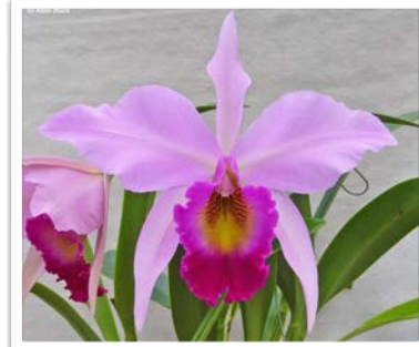
Rhyncatlaelia Janice Pettee 'Blumen Insel'