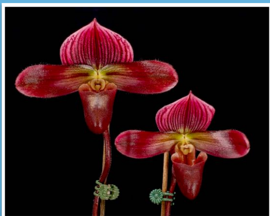
Paphiopedilum (Hung Sheng Lake x Shin-Yi Heart) AM/AOS 82pts

All awards are considered provisional until paperwork and payment is processed by AOS and published in OrchidPro. AOS award photographs are for exhibitors' personal use and are permitted to be used for AOS and affiliated societies purposes and programs. Not for magazine, advertising, publishing, or internet use without the express written consent of the photographer.