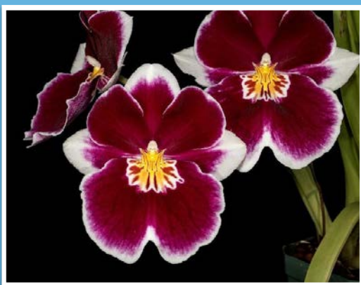
Miltoniopsis Salmon Bay 'Hansen' AM/AOS 80 pts

All awards are considered provisional until paperwork and payment is processed by AOS and published in OrchidPro. AOS award photographs are for exhibitors' personal use and are permitted to be used for AOS and affiliated societies purposes and programs. Not for magazine, advertising, publishing, or internet use without the express written consent of the photographer.