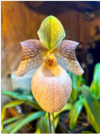
Paphiopedilum Liberty Taiwan ( Paph micranthum 'Red Delight' x Paph hangianum 'Red Moon')