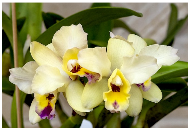
Laeliocattleya Amarilis Pagan Grown and photographed by Pat Randall

Pat grows all four of these Cattleya hybrids under lights and in medium bark. They are allowed to dry out, and then they get a good, thorough watering.