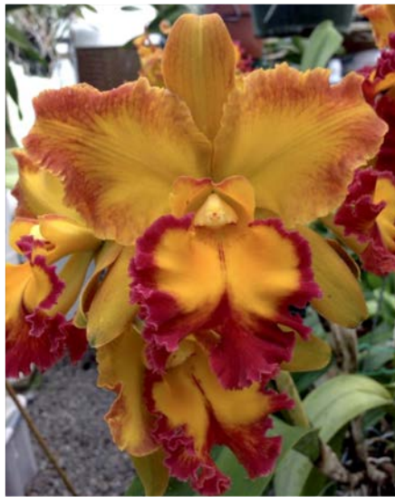
Potinara Caesar's Head 'Carolina Autumn' (syn. Rhynholaeliocattleya Caesar's Head Carolina Autumn')