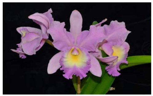
Brassolaeliocattleya Mishima Luminous x Rhyc. Blumen Insel