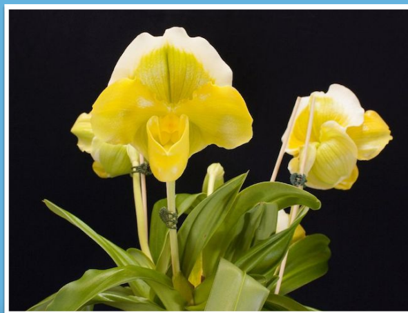
Paphiopedilum Cocoa Lovely Oliver 'Romilda'