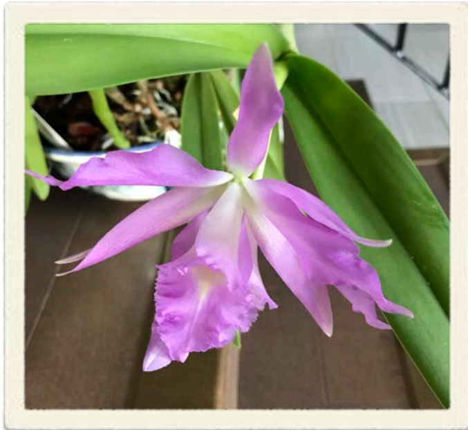
Cattleya skinneri x Rhyncholaelia digbyana

This plant is grown under lights in the basement greenhouse, watered and fertilized weekly. It has a pleasant fragrance.