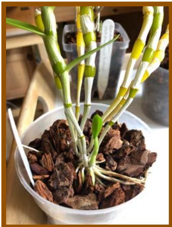
Dendrobium Hot Pulany x Dendrobium Kurenai

Spring and summer: bright filtered light; increased water and fertilizer.