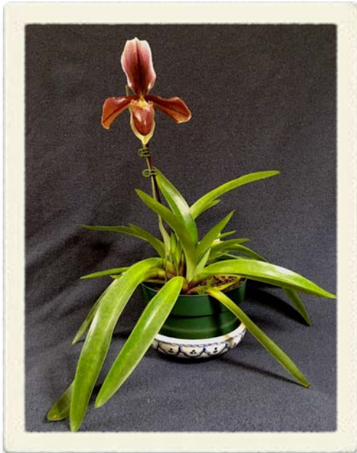
Paphiopedilum King Arthur