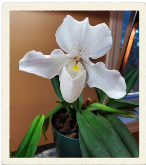
Paphiopedilum F.C. Puddle

It is one of my first and I have had it for many years, since May 29, 2006.