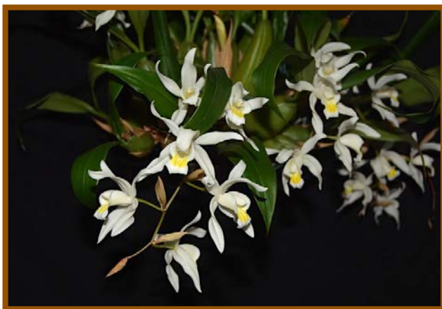
Coelogyne Unchained Melody

Unique flowers appear in winter, looking at first like a rat's tail as it emerges from the newly forming leaf.