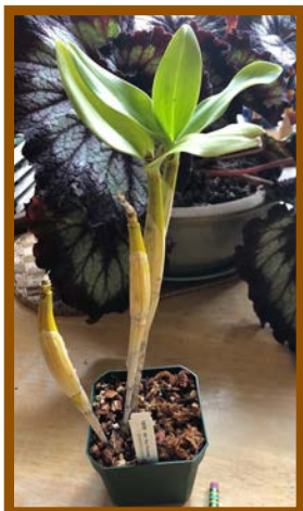
Dendrobium Roy Tokunaga ( atroviolaceum x johnsoniae )

Place it on a bright east cool windowsill at the end of October and don't look at it again until March!