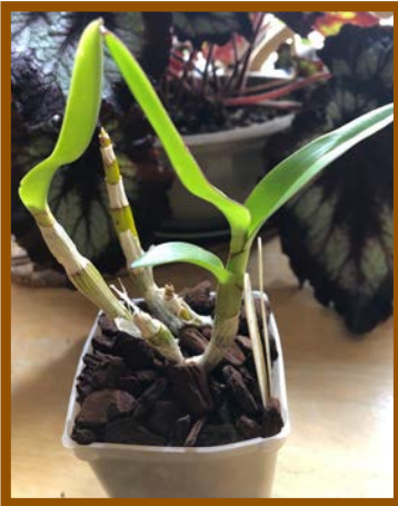
Dendrobium Blue Sparkle x Dendrobium Blue Twinkle