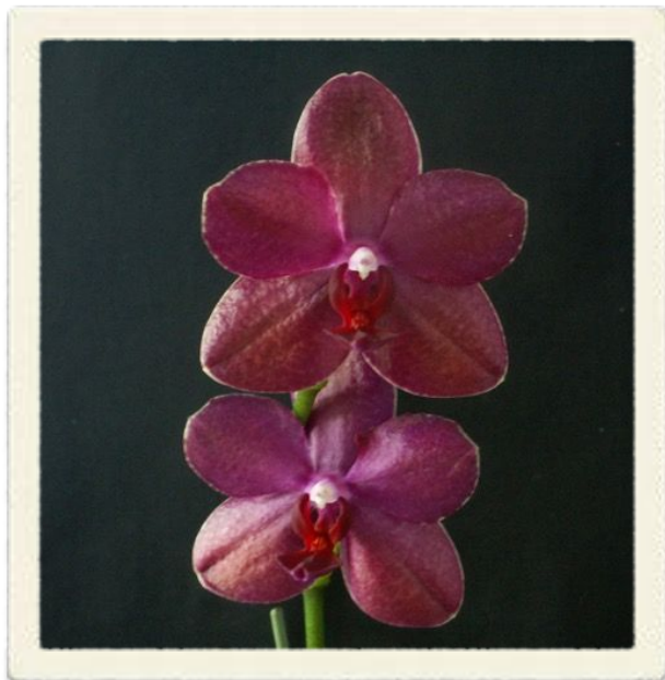
Phalaenopsis Fancy Cat '#5'

I grow all of my Phalaenopsis in Promix HP under lights, watering once a week with fertilizer.