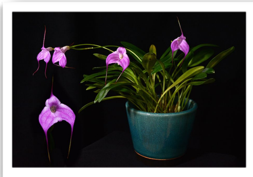
Masdevallia Cutie Grown by Tracey Thue