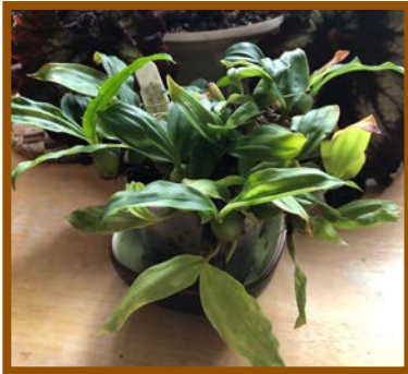
Pholidota chinensis 'Nisqually'