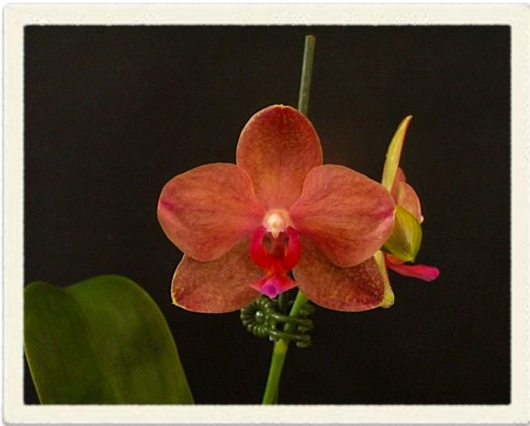
Phalaenopsis OVT 'F21'