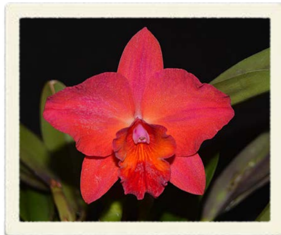
Potinara Mark's Valentine