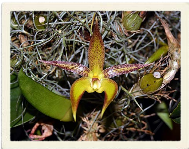
Bulbophyllum Madeline Nelson