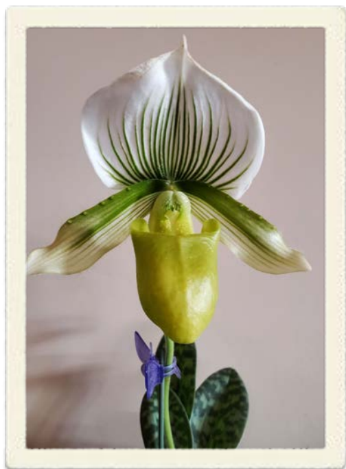
Paphiopedilum Maudiae 'Rowland' x Paphiopedilum Onyx 'Green Tag' AM/AOS

This is an old faithful that blooms regularly. It sits in the east kitchen window.