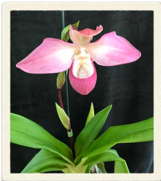
Phragmipedium Suzanne Decker