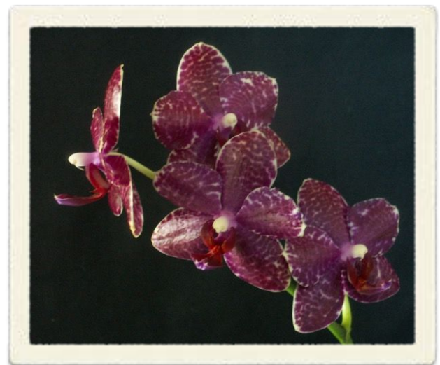
Phalaenopsis Gold Cat '#2a'