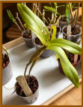
Dendrobium Pacific Delight (Herman Slade x atrovioleaceum)

Bright light, no rest period, intermediate temperature.