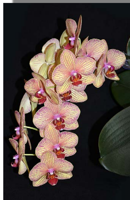
Phalaenopsis Balidan's Kaleidoscope 'Golden Treasure' AM/AOS Grower: Lynn Campbell