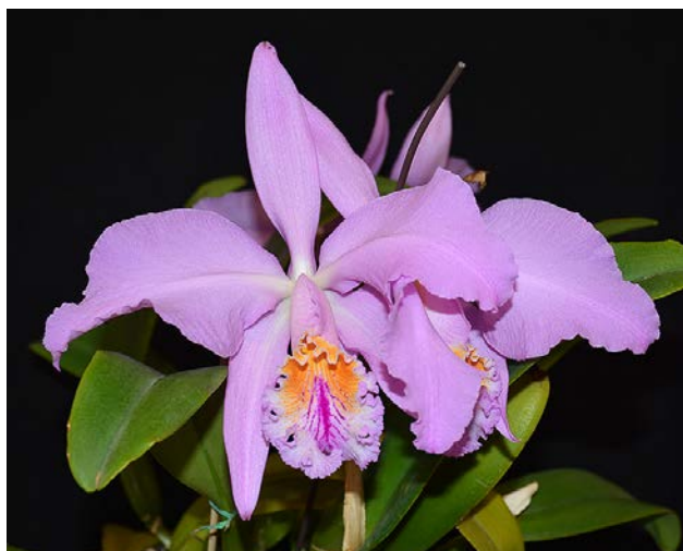
Cattleya mossiae Grower: Pat Randall