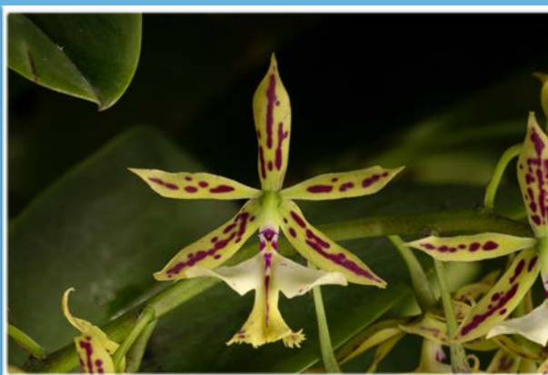
Epidendrum stamfordianum 'Too Cool' CCM/AOS 84 pts Exhibitor: Darrell Albert