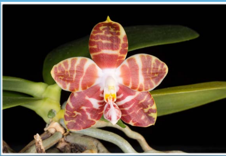
Phalaenopsis amboinensis 'Sarah' HCC/AOS 78 pts

Please note that all awards are considered provisional until paperwork and payment is processed by AOS and published in Orchid Plus.