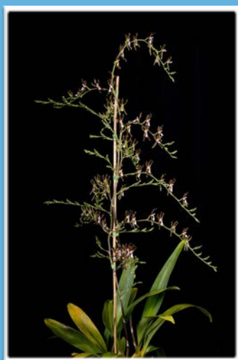
Oncidium leave 'Drury' CCM/AOS 81 pts Exhibitor: Orchid Species Preservation Foundation