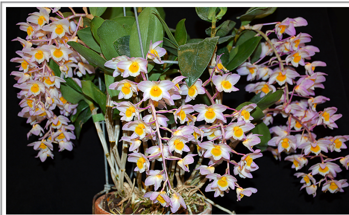
Dendrobium amabile Grower: Wilma Regehr