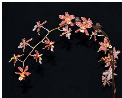
Oncidium Downtown Honolulu Grower: Tracey Thue