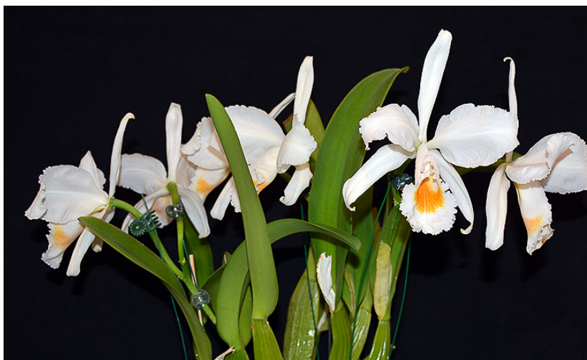
Cattleya schroederae (SVO II HCC/AOS x SVO AM/AOS) Grower: Pat Randall