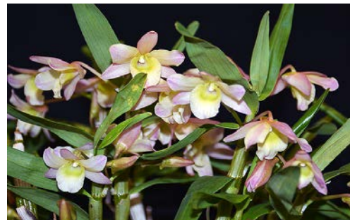
Dendrobium Spring Bird 'Kurashiki' Grown by Yvette Lyster