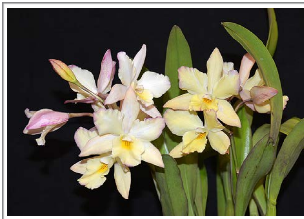
Jackfowleara Apple Blossom Grower: Pat Randall