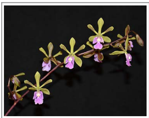
Epicyclia Serena O'Neil Grower: Tracey Thue