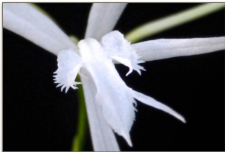
Epidendrum blepharoclinium var. album

The OSPF was founded in 1991 with a collection of around 2000 plants obtained from the family of Lorne S. Murphy of Vancouver. The collection of over 4000 plants representing 139 genera, 945 species and 400 hybrids, is co-managed with the City of