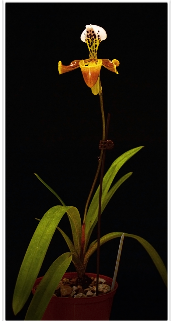
Paphiopedilum gratixianum Exhibitor: Don Keith