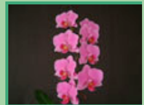
PHAL SUN JE DIAMOND

DRACULA VERTICULOSA F. ALBA – A MORE RECENT ADDITION TO THIS ELITE GROUP, ALL DIVISIONS ORIGINATE FROM A SINGLE PLANT IN THE COLLECTION OF FRANCISCO BILLEGAS OF MEDELLIN, COLOMBIA. THERE IS A LOT OF BLOOM-TO-BLOOM VARIATION IN TAIL LENGTH AND FOLLOWER SIZE WITH THIS PARTICULAR CLONE, BUT THE INSIDE COLOR IS AN