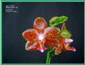
PHAL BEDFORD GEM

REMEMBER THE NEW LOCATION OF MEETINGS, JOHN DOLAN SCHOOL.