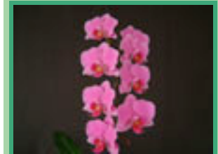
PHAL SUN JE DIAMOND