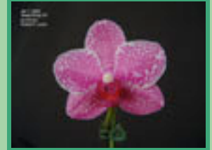
PHAL TEXAS FANCY

A KIND OF PLANT DISTINCT FROM OTHER KINDS.