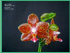
PHAL BEDFORD GEM

SPECIAL PHOTO ISSUE OF THE NEWS- LETTER: DEADLINE FOR SUBMISSIONS IS AUGUST 24 TH , 2008