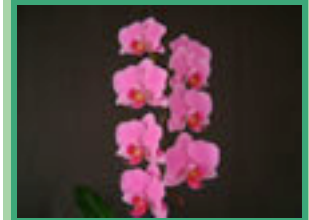
PHAL SUN JE DIAMOND

AT THE MAY MEETING THE SOCIETY PUTS THE NAMES OF THOSE WHO BROUGHT PLANTS FOR SHOW AND TELL THROUGH