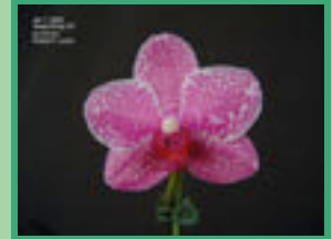
PHAL TEXAS FANCY

AFTER ALL, PERSONALITIES, ATTITUDES, EMOTIONS, EXPERIENCE AND KNOWLEDGE ARE QUALITIES THAT MAKE LIFE SO INTERESTING. HOWEVER, THEY CAN ALSO MAKE ANY JUDGING A CHALLENGING TASK.