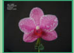
PHAL TEXAS FANCY

AMONG THE MOST BIZARRE ORCHIDS ARE THOSE IN THE GENUS OPHYRS . OPHYRS MEANS "EYEBROW," AND THIS HAIRY ORCHID BEARS AN ALMOST UNCANNY RESEMBLANCE TO FEMALE BEES AND WASPS. PLANTS OF THIS GENUS EVEN EMIT A FRAGRANCE IDENTICAL TO THAT PRODUCED IN THE DUFOUR'S GLAND OF FEMALE BEES IN NEED OF A LITTLE MALE COMPANIONSHIP. THE ORCHID LIP HAS A TINY RIDGE, IDENTICAL TO THE RIDGE SURROUNDING THE GENITAL APPARATUS OF A FEMALE BEE. IN THE SPRING, MALE SOLITARY BEES COME OUT OF THE GROUND LOOKING TO MATE. THERE ARE FEWER