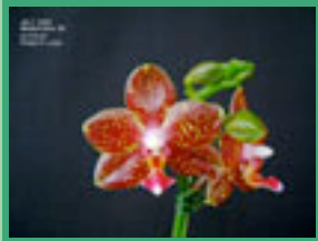
PHAL BEDFORD GEM