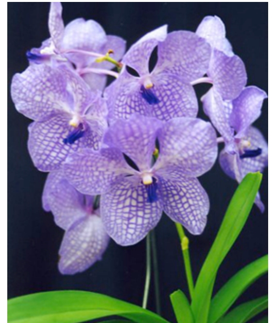
VANDA BANGKOK BLUE

I HOPE THIS INFORMATION WILL BE HELPFUL TO ANYONE WISHING TO GROW AND BLOOM THIS TYPE OF ORCHID.