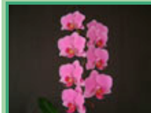
PHAL SUN JE DIAMOND