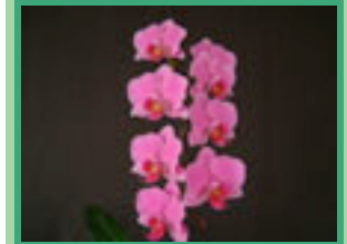
PHAL SUN JE DIAMOND

CHANTHORN ORDER LIST – THERE ARE SOME COPIES IN THE LIBRARY, REMEMBER WE ARE TAKING YOUR ORDERS AT THE FEBRUARY MEETING SO HAVE THEM READY WITH YOUR MONEY TO COVER HALF THE COST OF YOUR ORDER. SHE HAD MENTIONED ATTENDING WINNIPEG INSTEAD OF GARDENSCAPE, BUT SHE IS NOT LISTED AS A VENDOR AT WINNIPEG, SO WE