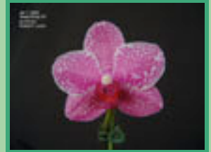
PHAL TEXAS FANCY

EDITORS NOTE: MY APOLOGIES FOR THE ABBREVIATED NEWSLETTER THIS MONTH. I AM LEAVING ON A JET PLANE AND I DON'T KNOW WHEN I WILL BE BACK AGAIN.