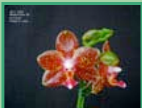
PHAL BEDFORD GEM