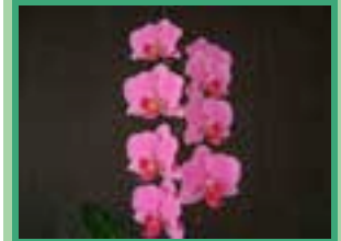
PHAL SUN JE DIAMOND