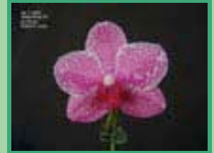
PHAL TEXAS FANCY

PEAK FLOWERING SEASON IS EARLY APRIL TO JULY; HOWEVER,