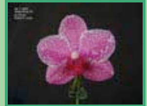
PHAL TEXAS FANCY

WE HAVE GROWN A NUMBER OF SPECIMEN PLANTS FOR THE PLEASURE IT GIVES US TO SEE THEM LARGE, HEALTHY AND IN FULL BLOOM. WE START WITH A PLANT THAT GROWS IN A SNUG FASHION. THAT IS WITH THE GROWTHS CLOSE TOGETHER SO THAT A LARGE PLANT CAN BE GROWN IN A REASONABLE AMOUNT OF SPACE. THIS PLANT SHOULD HAVE A HABIT OF FLOWERING ON EVERY GROWTH WITH FLOWERS BORNE ON TALL STEMS, AND MORE THAN AVERAGE NUMBERS OF FLOWERS PER STEM. THIS PLANT SHOULD BREAK MULTIPLE LEADS AND FLOWER ON ALL OF THEM. THE FLOWERS SHOULD BE BETTER THAN AVERAGE FOR THEIR KIND. THIS IS A LARGE ORDER, BUT EVERY GREENHOUSE DOES HAVE A FEW SUCH PLANTS IN IT IF WE WATCH FOR THEM. PLANTS THAT GROW WITH WIDELY SPACED GROWTHS PRODUCED ONE AT A TIME SO THAT THE PLANT GALLOPS IN A STRAIGHT LINE ACROSS THE POT ARE POOR SUBJECTS FOR SPECIMEN GROWING. THEY WILL NEVER REPAY THE GROWER FOR HIS TROUBLE.