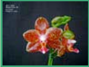
PHAL BEDFORD GEM

DID YOU KNOW THE LIBRARY HAS ITEMS TO GIVE AWAY?