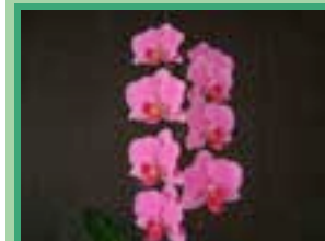
PHAL SUN JE DIAMOND

LARGE MAUVE CATTLEYA NOT BLOOMING BUT LOTS OF GROWTH. LEAVES SEEM A LITTLE SOFT, SO ENSURE CALCIUM IN FERTILIZER. TRY MORE LIGHT AND AN EVENING DROP OF 10°F TO ENCOURAGE BLOOMING. USE FERTILIZER WITH A HIGH MIDDLE NUMBER TO ENCOURAGE BLOOMING INSTEAD OF GROWTH.