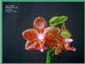
PHAL BEDFORD GEM